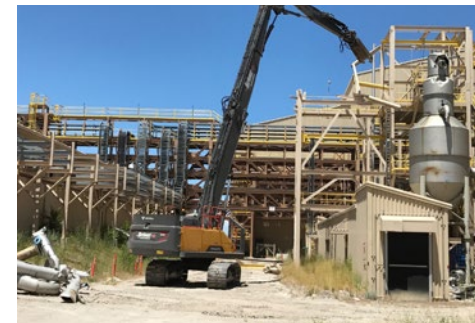
Molybdenum Processing Facility SALT LAKE CITY, UT

This unique project involved the asset sale, rigging and removal of mineral processing equipment and the subsequent demolition of a significant 30 acre facility.