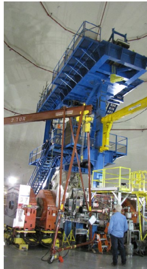
Nuclear Laboratory LOS ALAMOS, NM

This unique project involved the asset sale, rigging and removal of mineral processing equipment and the subsequent demolition of a significant 30 acre facility.