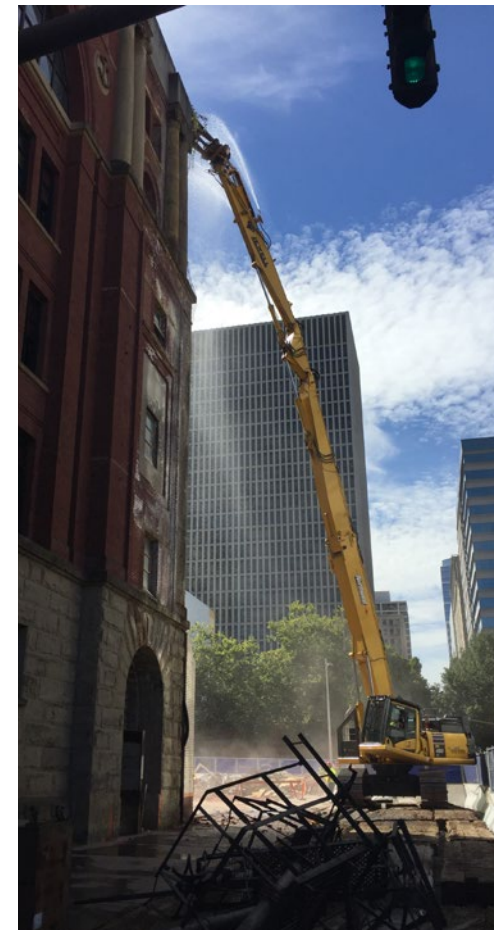
Delicate Multi-story Demolition PORTLAND, OR

This challenging project involved the engineering, dismantling and removal of a large experimental apparatus consisting primarily of two massive magnets weighing 140 tons each. Following and during dismantling, each piece of this elaborate puzzle was radiologically surveyed for release.