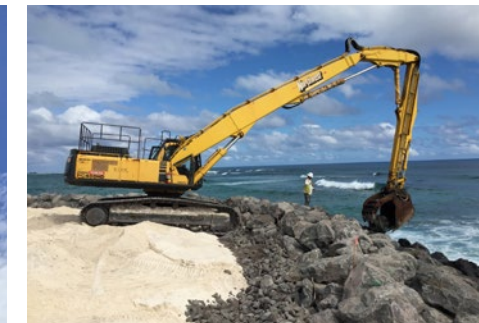
Landfill Rip Rap Repair Project MIDWAY ISLAND

This 9 story unreinforced structure was demolished within the busy Portland, OR downtown core with the use of a high reach excavator following a detailed engineering plan.