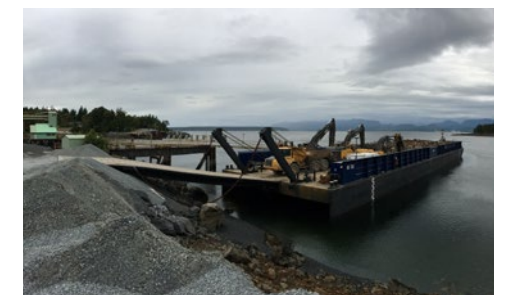
Remote Location Mining Equipment Demolition BC, CANADA

From 2011 through this year, we have worked for US Fish and Wildlife on remote Midway Island remediating tens of thousands of yards of lead contaminated soil.