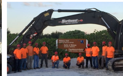
Soil Remediation Project MIDWAY ISLAND

A truly unique project, this work involved working at up to 100 feet below ground surface to demolish and remove the concrete and steel structure that was used to house and manage the previously removed reactor.